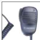
Remote Speaker Mic JMN4067