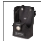
Nylon Case with Swivel Clip ** PMLN4470