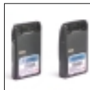
Slim & Hicap Lilon Batteries JMN4023/4024