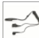
Lightweight Headset with Boom Mic PMLN4519