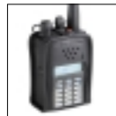
Hard Leather Case with Swivel Clip ** PMLN4471