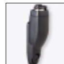
Accessory Adaptor PMLN4455