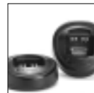
Single Rapid Charger PMTN4025