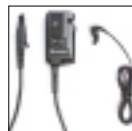
Ear mic VOX/PTT Interface Module with Earmic BDN6677 JMN4064