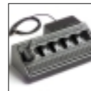
Multi-Unit Rapid Charger PMTN4028