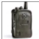
Soft Leather Case with Swivel Clip ** PMLN4421